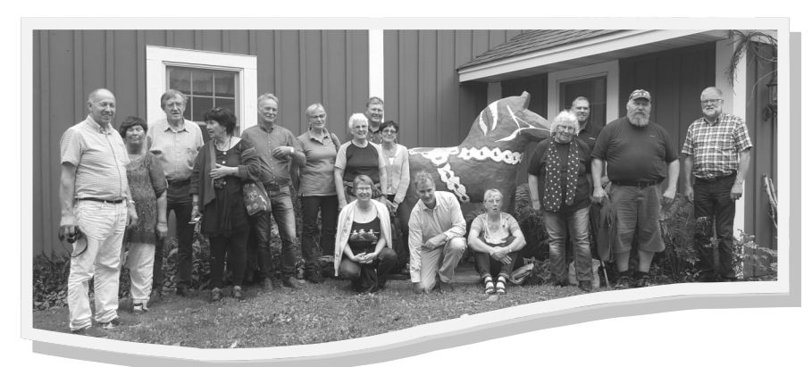
The Swedish visitor group at the Gammelgarden Museum near Lindstrom