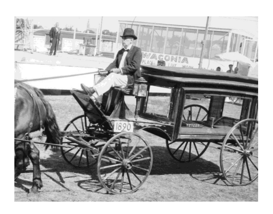
An 1890 hearse

"Please Join Us in Remembering..." runs through March 2, 2013.