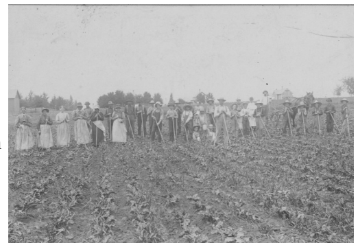
Migrant workers hoeing sugar beets Chaska

Contact Eve at eweipert@co.carver.mn.us or 952-442-4234.