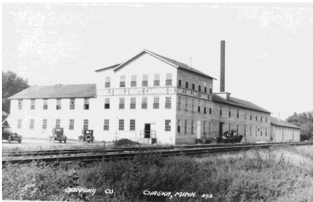
Amels and White Canning Company