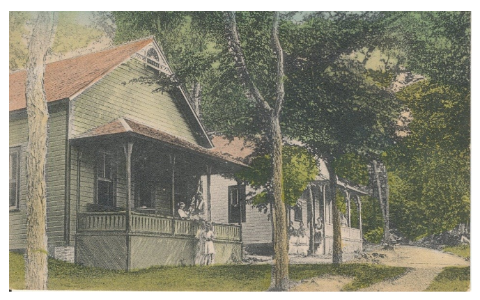
Top left: Coney Island resort cottages

Top right: Coney Island Hotel (1st hotel, later staff dormitory and caretaker's residence)