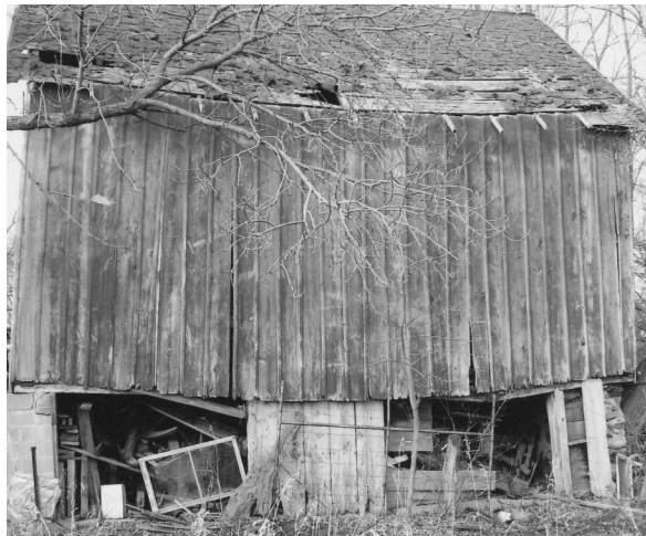
Above: the North Barn in late 2008, prior to its collapse.